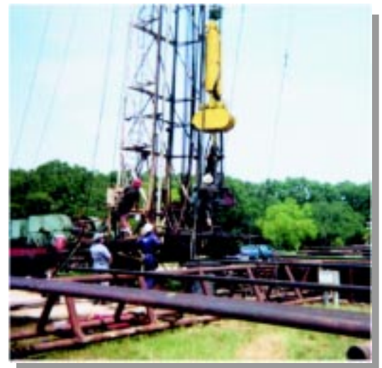
Vibration Technology Oscillator Used in a Mud Stuck Tubing Recovery Operation.